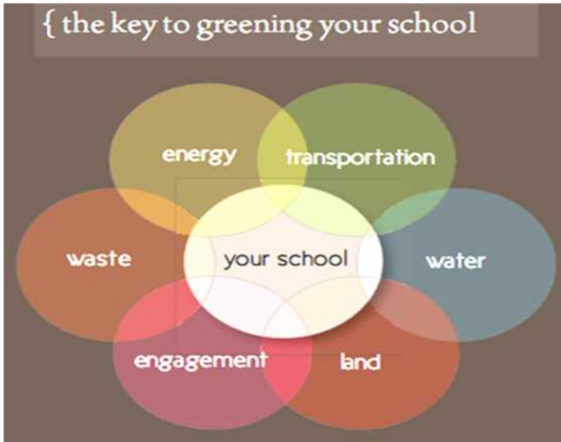
Figure 1: Determinants for Greening Schools Environment, adopted from The Academy for Global Citizenship, (2011)

Indeed, in a recent report, by the American Society of Civil Engineers (2009) observed that there is growing attention for the need to improve the school environment through healthy building, green design and operations, and this trend is growing. It is worthy to note that this awareness has made a great impact on school administrators and designers to have clear features of setting a green school that can provide learning opportunities for students and support healthy and natural environments for current and future generations.